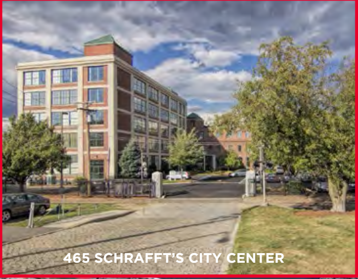
465 SCHRAFFT'S CITY CENTER